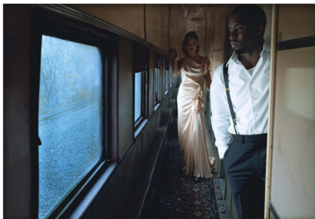
Sean "Diddy" Combs The megamogul embarks on a movieland romance Plus: video at the fashion shoot

SUBSCRIBE | ACCESSORIES | FEATURES | STYLE GUIDES | BEAUTY | PEOPLE ARE TALKING ABOUT | VOGUE DAILY | STYLE.COM 60